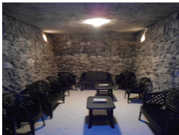
Fig. 1 Halotherapy chamber with artificial salt-mine environment” of INRMFB, Bucharest, 11A, Ion Mihalache Blvd.

When patients for the experimental HT treatment were selected, 18 patients were investigated (16 adults and 2 infants with ages between 6–13 years) with bronchial asthma and chronic bronchitis, chronic obstructive bronchopneumopathy, of whom 14 had bronchial asthma with therapeutic control and partial control (atopic - 2, mixed-12; moderate - 2), also suffering from other pathologies like allergic rhinitis (including moderate persistence), rhinosinusitis, respiratory virosis, viral post-pneumonia condition, chronic gastritis, duodenal ulcer, ischemic coronary disease, light mitral failure, atopic dermatitis, chronic bronchitis, hypertensive cardiomyopathy, HTAE 1-2 degree, lumbar discopathy, cervical spondylosis, osteoporosis, hypothyreosis, hemorrhoid disease, dyslipidemia, obesity III degree, urinary infection; 4 patients with chronic bronchitis or chronic obstructive bronchopneumopathy (II and III) with acute exacerbation of GOLD (1 case), showing arrhythmia, tachycardia, dyslipidemia.